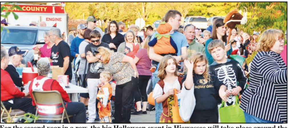
For the second year in a row, the big Halloween event in Hiawassee will take place around the Towns County Courthouse instead of on the Town Square.